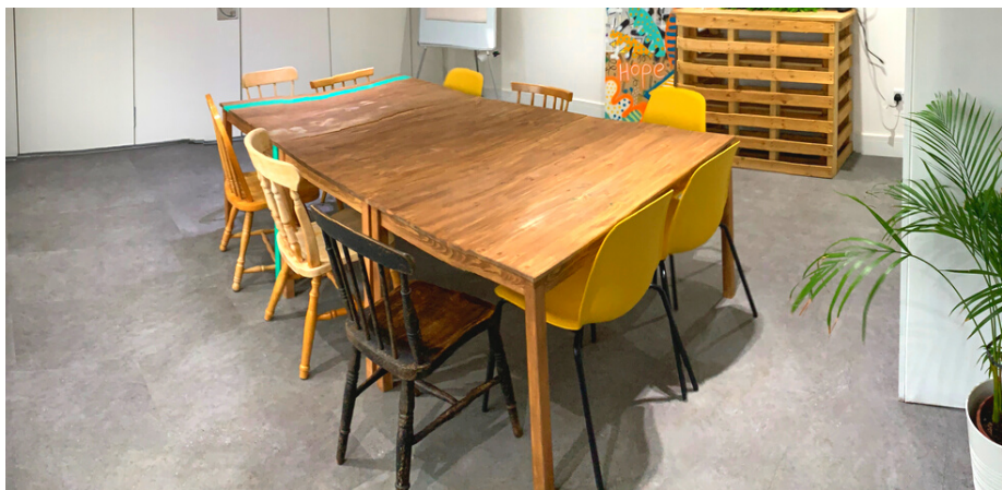
LAYOUT OPTION: CONFERENCE STYLE - SEATING 8-12