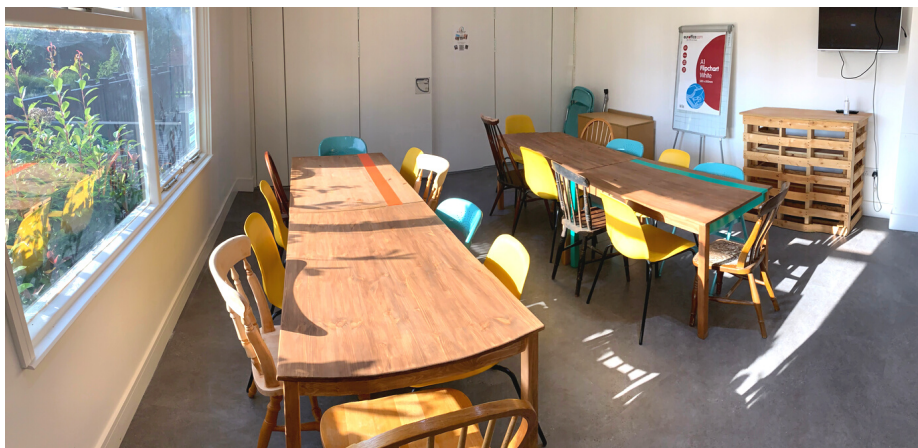
LAYOUT OPTION: BANQUET STYLE - SEATING 16-20

AVAILABLE TO HIRE MONDAY TO SATURDAY, OR ALONGSIDE A SUNDAY CAFE BOOKING