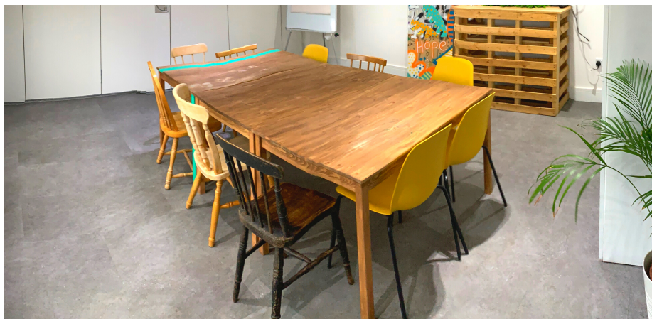
LAYOUT OPTION: CONFERENCE STYLE - SEATING 8-12